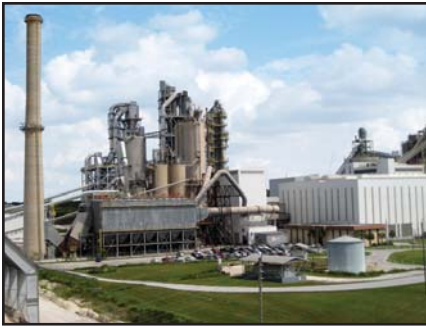
133 MW pulverized coal-fired plant in Florida.