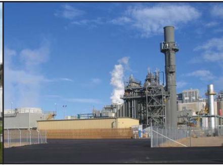
55 MW natural gas-fired plant in California.