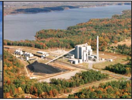
132 MW pulverized coal-fired plant in Virginia.

DPS' efforts in this area have resulted in a nearly 40% improvement in regulatory compliance since 2005. Our 2005 to 2008 cumulative Occupational Safety & Health Administration (OSHA) recordable incident rate (RIR) has consistently outperformed the industry average. These numbers confirm that DPS' EH&S programs have positive effects on overall plant culture and work environment, and ultimately, facilitate peak performance.