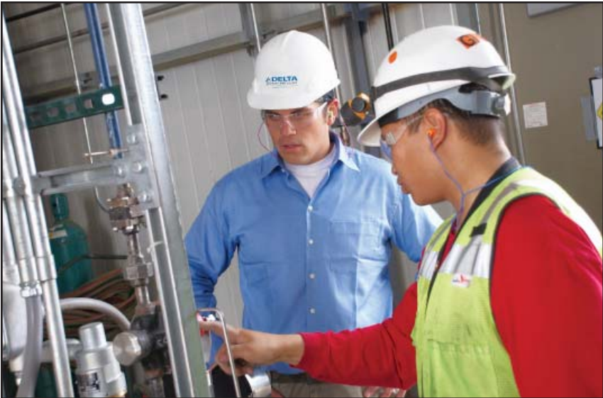
DPS aggressively strives for 100 percent compliance with all environmental, health and safety requirements.

Possessing a demonstrated record of plant improvement, DPS’ ultimate goal is to improve bottom line results. Whether the results are plant heat rate efficiency, reliability, availability, safety or a combination of several measurable objectives, we possess the experience and capabilities to deliver.