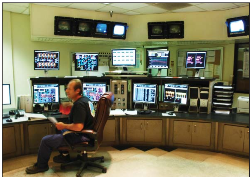
Operational, maintenance and administrative services are part of the overall capabilities of Delta Power Services.